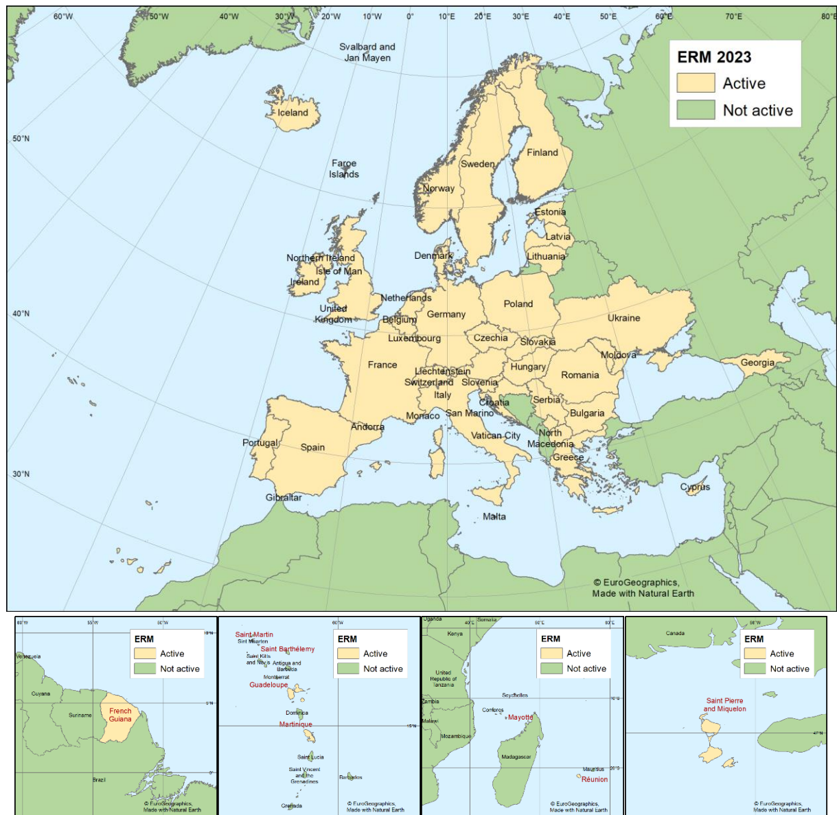
Figure 1: Geographic extent of ERM (overview)